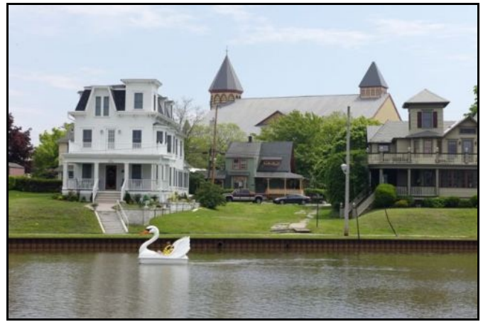
Swan Boats at Wesley Lake

After a closing dinner, (continued on page 5)