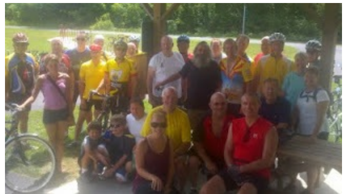
Ohio's Pedaling Parsons